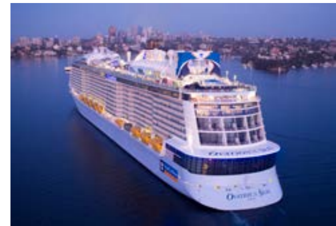
Ovation of the Seas