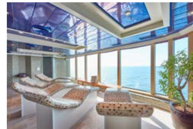
Queen Victoria Spa