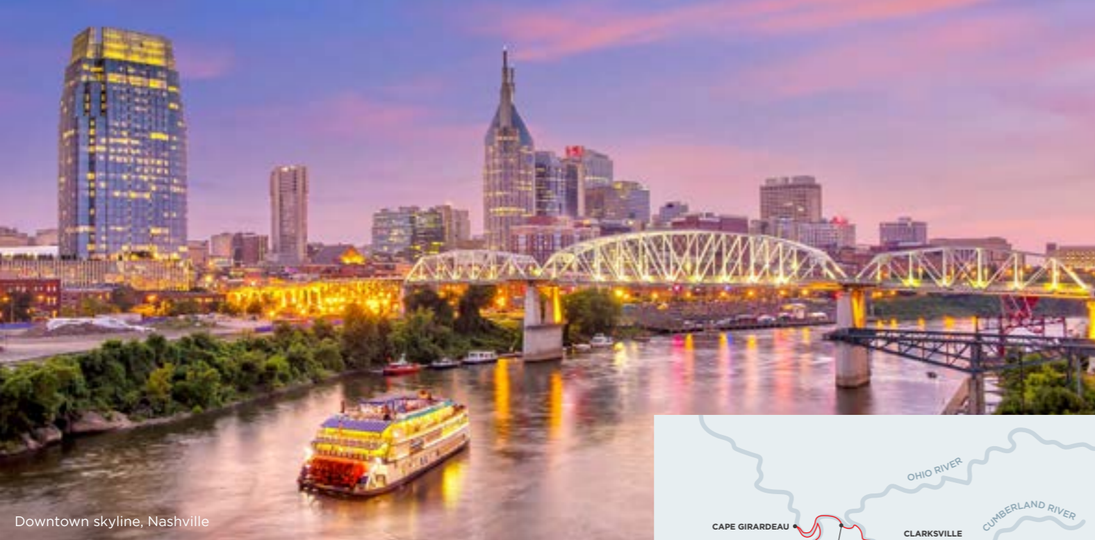
Downtown skyline, Nashville