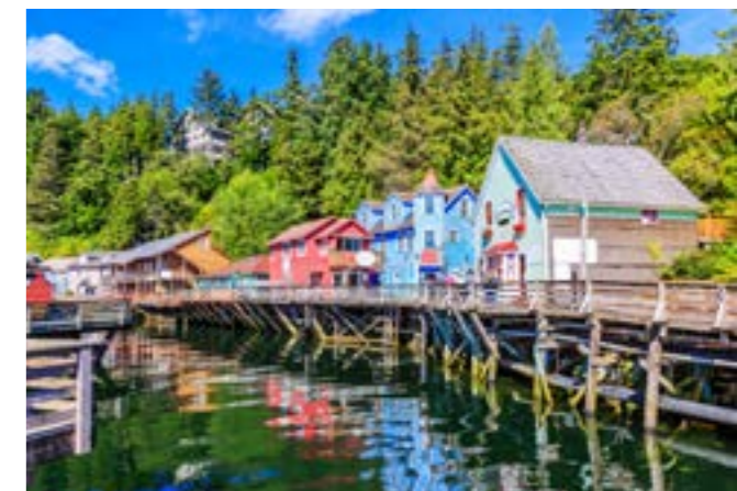
Creek Street, Ketchikan