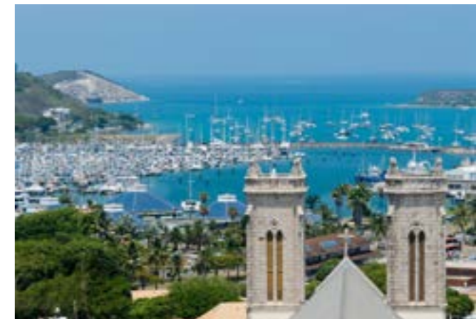
Moselle Bay, Noumea