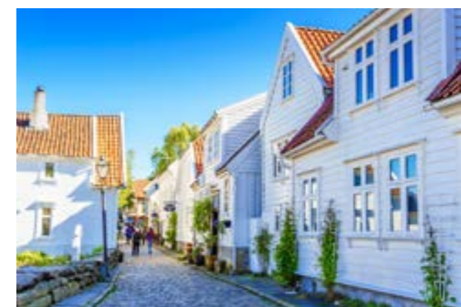
Cobblestone streets of Stavanger