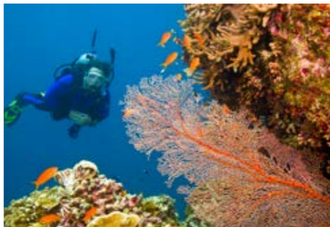
Great Barrier Reef