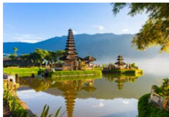
Ulun Danu Beratan Temple, Bali