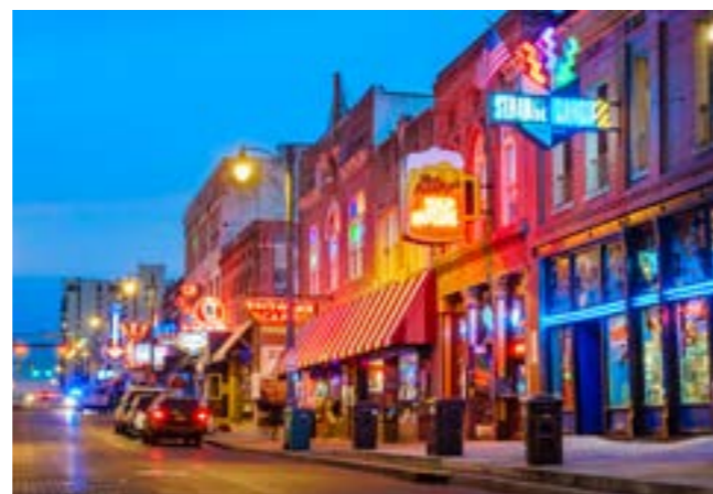
Beale Street, Memphis