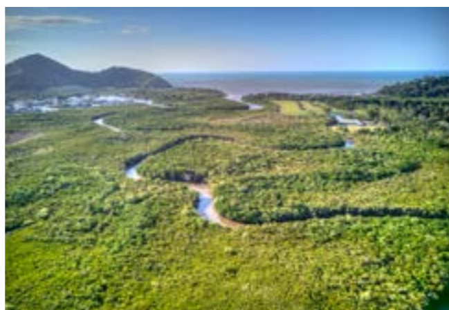
Yorkey's Knob, Cairns