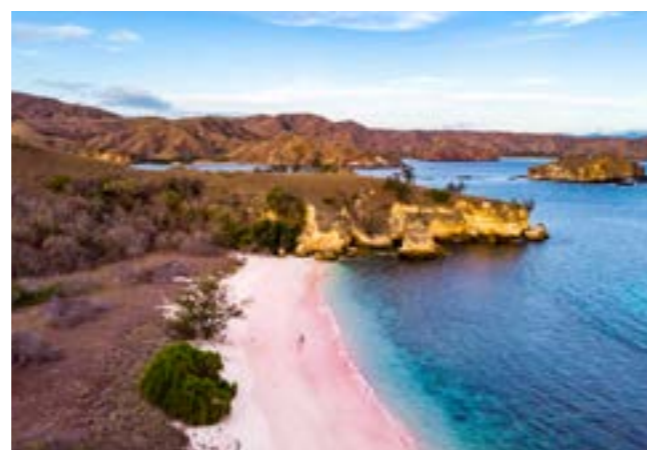
Pink Beach, Komodo Island