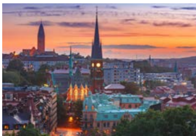
Gothenburg at sunset