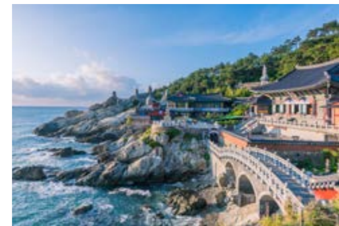
Haedong Yonggungsa Temple, Busan